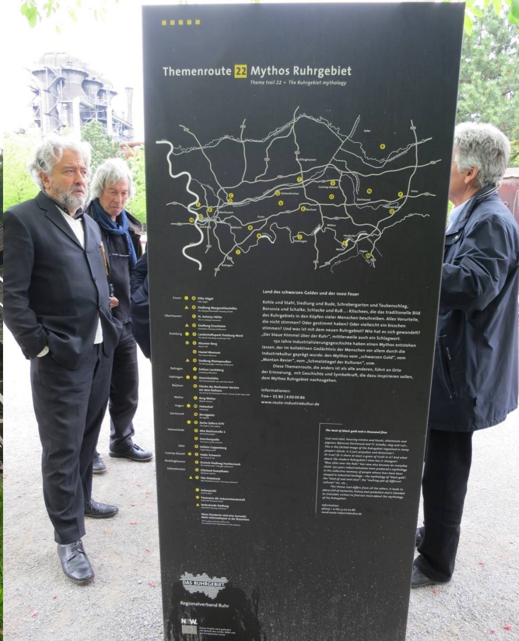
Discussion on informing the public about heritage included heritage trails in Ruhr and Westphalia areas.