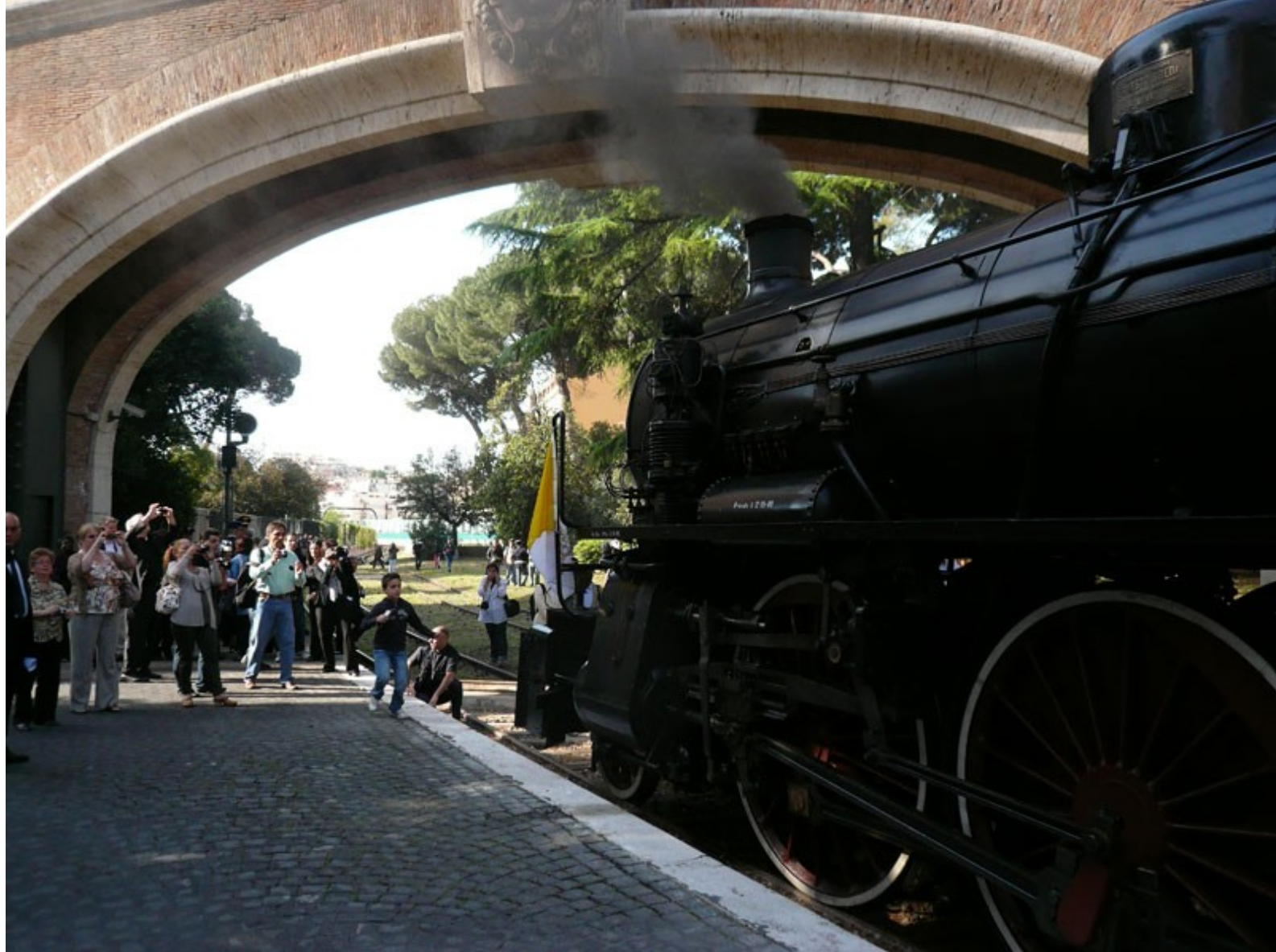
Outside events of industrial and engineering are also supported by IEHC. A trip from Rome's Vatican to Orvieto, using the 1932 papal train, hardly ever used and in mint condition. Hereby the papal train ready to cross the Vatican City wall for its heritage tour.