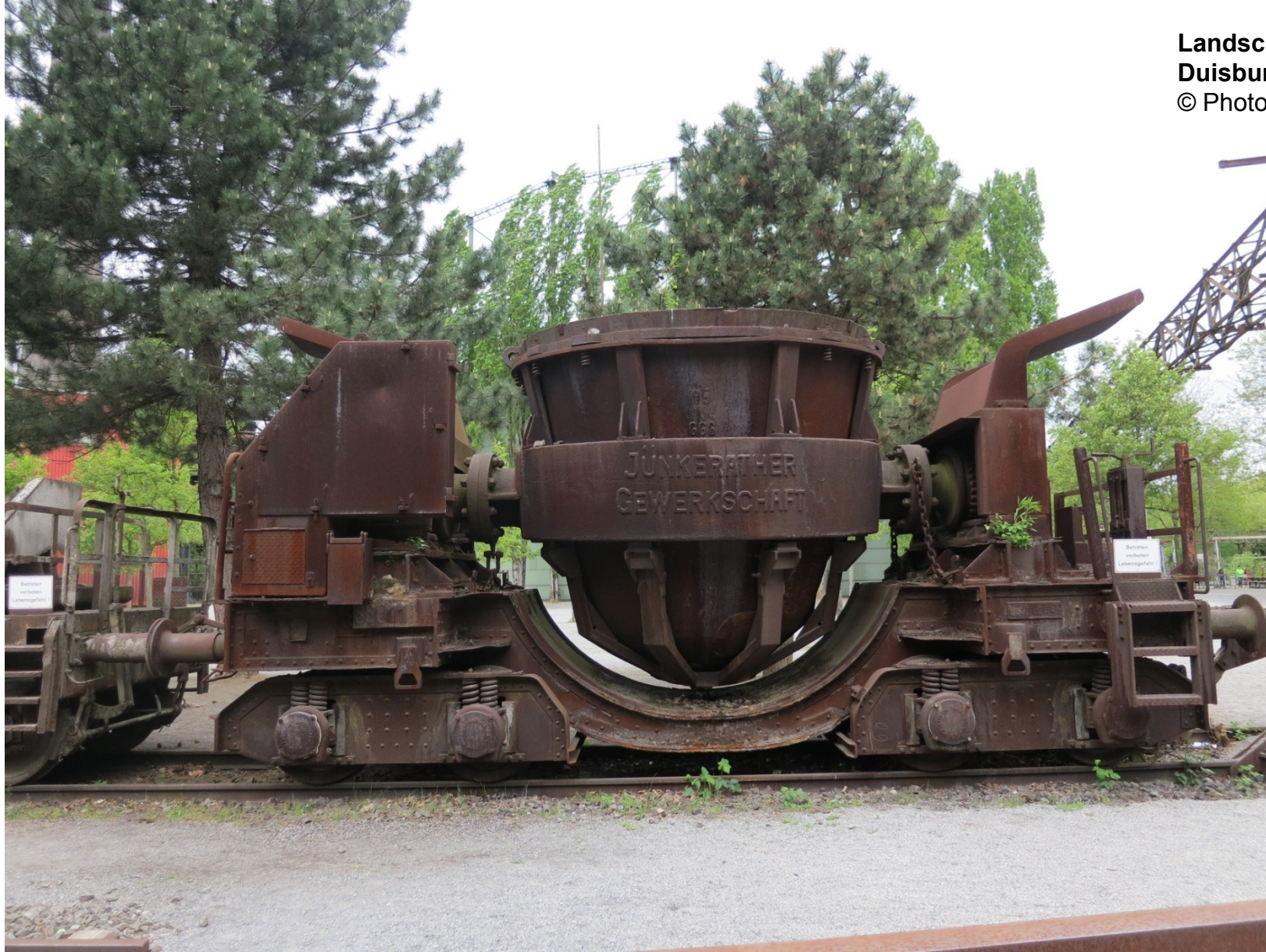
The 2013 scientific meeting included a tour in Landschaftspark Duisburg-Nord. See the early rail transport of melting ore.