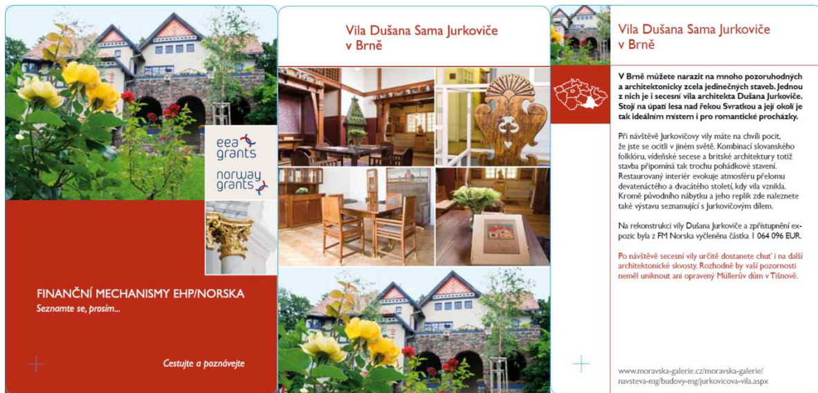
Publication "Meet the EEA and Norwegian Financial Mechanisms, please..."